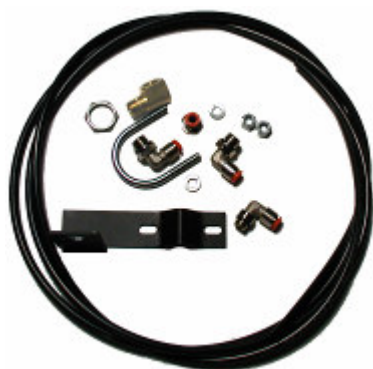
Basic Installation Kit