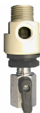
Self-Cleaning Strainer With Ball Valve