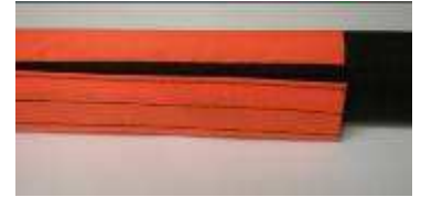
Coated side on Left—Uncoated on Right