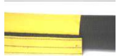
Coated side on Left—Uncoated on Right